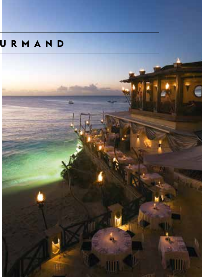
▲ Flaming torches and lapping seas offer a dramatic backdrop to your rum cocktails at The Cliff