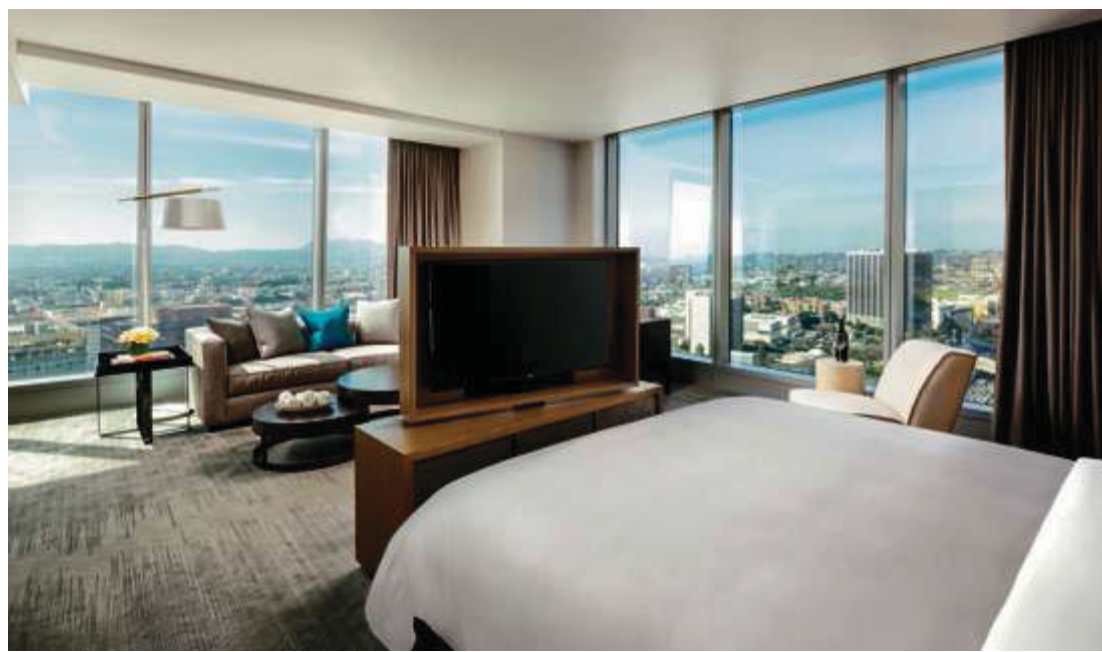
INTERCONTINENTAL LOS ANGELES

The InterContinental Downtown boasts the Sky Lobby on the 70th floor (above left and top left), a rooftop bar called Spire (top right), and sleek guest rooms (above right).