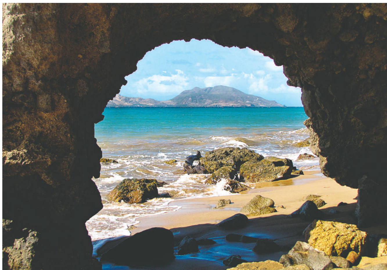
Arc of triumph: A view of St. Kitts from a quiet beach on the leeward side of Nevis.

Thirsty, I requested a detour to Mansa's Last Stop, a roadside store stocked with