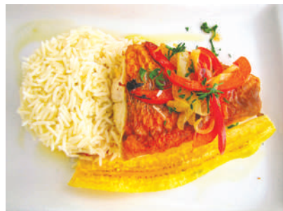
Full plates: From top, the sleepy capital, Charlestown; conch fritters served at Sunshine's, a beachfront hangout; and pan-seared red snapper served at the Montpelier Plantation &amp; Beach hotel.

staple groceries, beer, produce grown on a small organic farm and homemade seasonal juices such as carambola, sorrel, passion fruit and cucumber. Out in the extensive growing fields behind the shop, we found Mervin "Mansa" Tyson, a reed-thin man with Rasta dreads and a big smile, who offered us a tomato, warm and sweet off the vine.